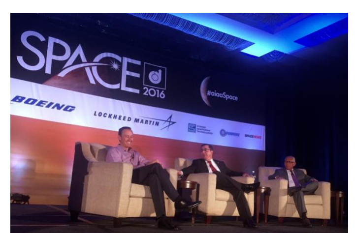
FIGURE 5 NASA PARTICIPATION IN A MEDIA FORUM

It is vital for the NASA mission to maximize openness with the media and the American people, as supported by the National Aeronautics and Space Act as amended. Policies governing NASA media relations can primarily be found in 14 CFR 1213.105, Release of Information to News and Information Media. NASA is dedicated to cultivating articulate and knowledgeable spokespersons, as specified in 14 CFR 1213.105(b). NASA encourages employees to speak to the media and the public about their work, provided that they coordinate with their immediate supervisor and public affairs office (14 CFR 1213.105(c)). NASA also encourages supported extramural