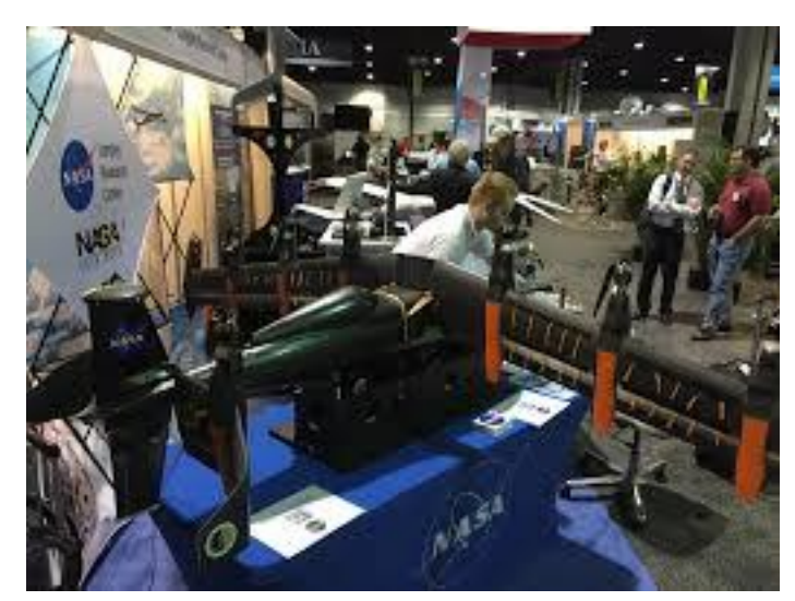
FIGURE 1 NASA PARTICIPATION IN RESEARCH CONFERENCE

As the nation's aeronautics and space agency, NASA is committed to transparency, integrity and thorough consideration of all outcomes of the research performed by the Agency. adheres to rigorous standards regarding professionalism and complies strictly with policies and systems for preserving the quality of information as well as objectively evaluating data and research findings, and maintaining the publications of peer-reviewed results. Additionally, NASA implements policies that protect human subjects in the course of research conducted for, and by, NASA (NASA Policy Directive (NPD) 7100.8E and NASA Procedural Requirements (NPR) 7100.1A Protection of Human Research Subjects). Furthermore, the agency has policies in place that require the proper care of animals when used in the