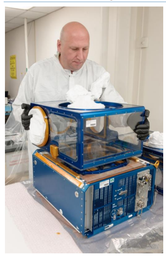
FIGURE 2 MICROGRAVITY HABITAT FOR MICE

sponsored, conducted, or supported by NASA is reviewed by an Institutional Review Board (IRB), and adheres to the principles of appropriate informed consent, as described in <a href="14">14 CFR Part 1230</a> and <a href="45">45 CFR Part 46</a> and the NASA regulations.