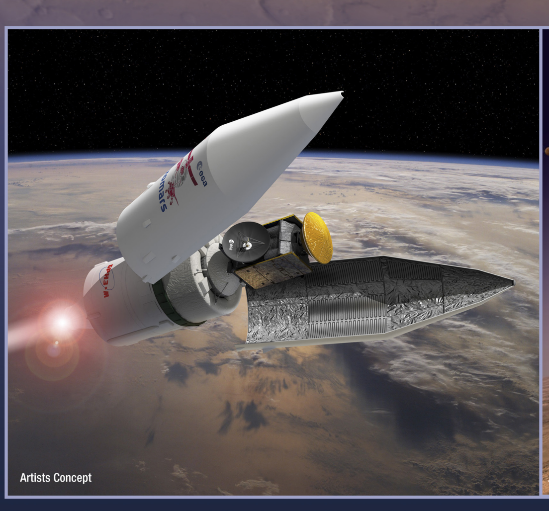
Separation of the payload fairing during launch sequence