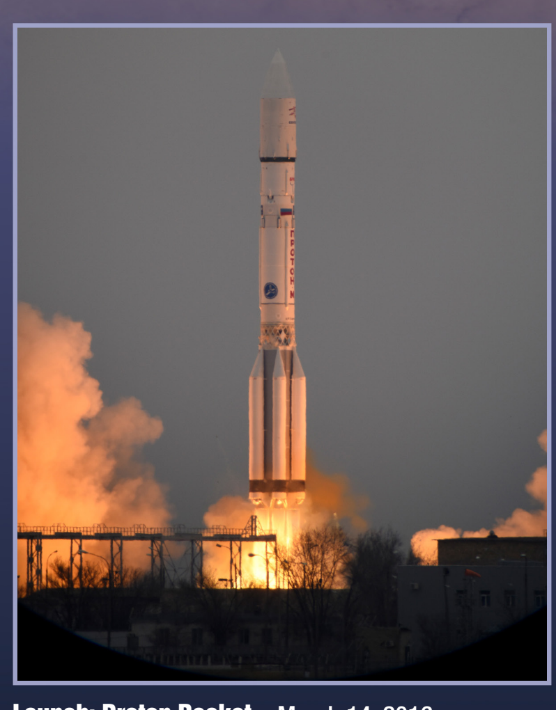
Launch: Proton Rocket – March 14, 2016 www.nasa.gov

Analyzing atmospheric gases for signs of active biological or geological processes on Mars, and testing key landing technologies