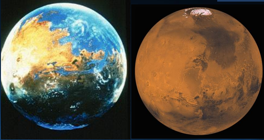
Evidence points to Mars being a warmer and wetter (left) place in the past unlike the desert planet it is today (right).