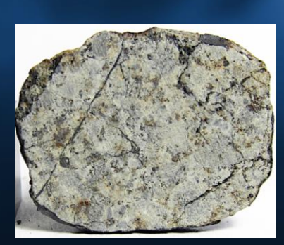
Chelyabinsk meteorite fragment Ordinary chondrite

Florence passed 4.4 million miles from Earth on September 1, this being one of many observations to determine its physical characteristics. Florence was discovered in 1981 by astronomer Schelte "Bobby" Bus and named for Florence Nightingale at the suggestion of Carolyn Shoemaker.