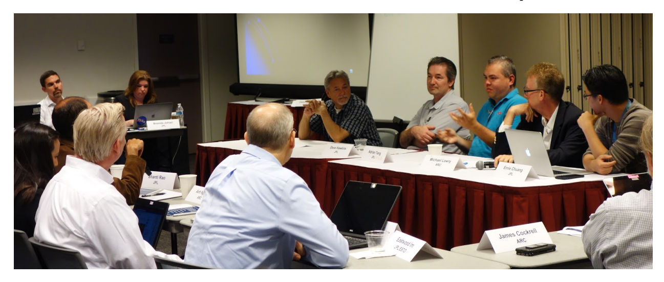
Figure 2: Discussion during the on-board processing session.