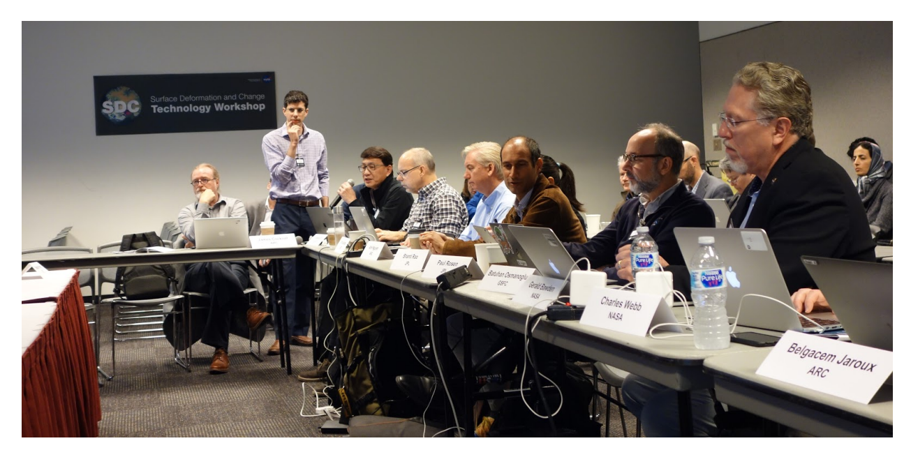
Figure 3: The SDC technology steering committee was placed front and center to foster a two-way engagement with the panelists.