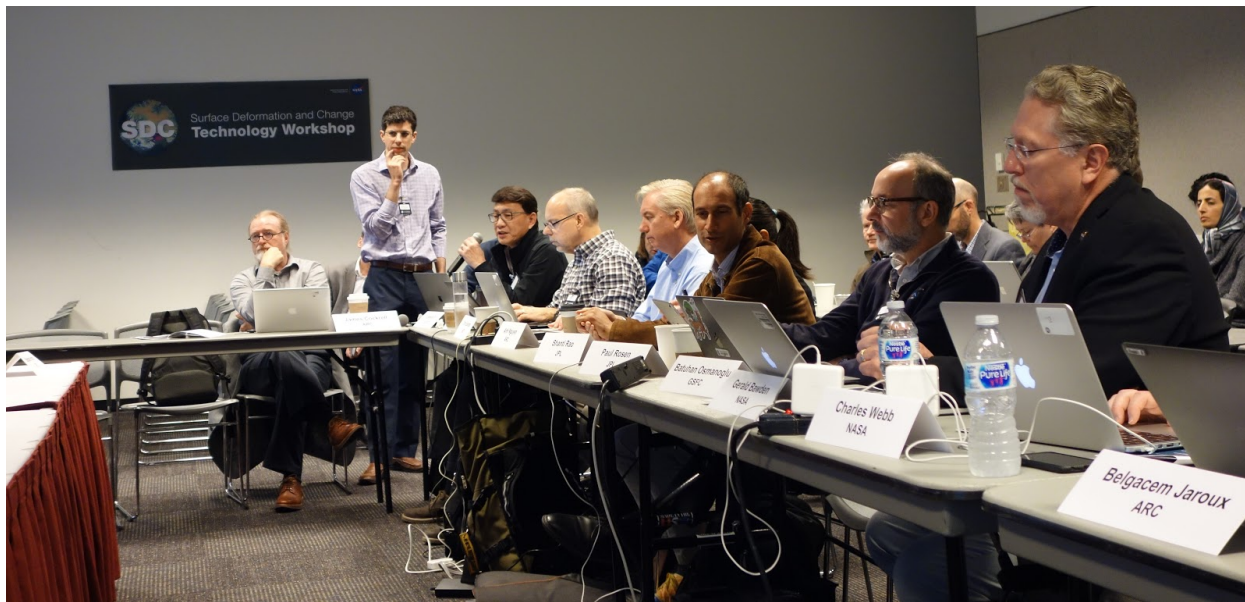
Figure 3: The SDC technology steering committee was placed front and center to foster a two-way engagement with the panelists.