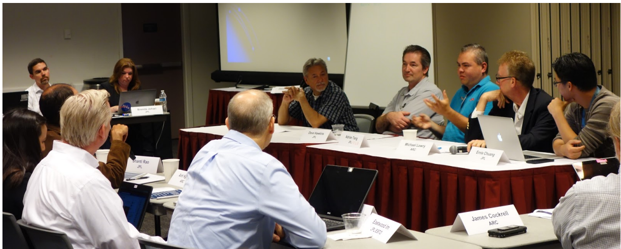
Figure 2: Discussion during the on-board processing session.