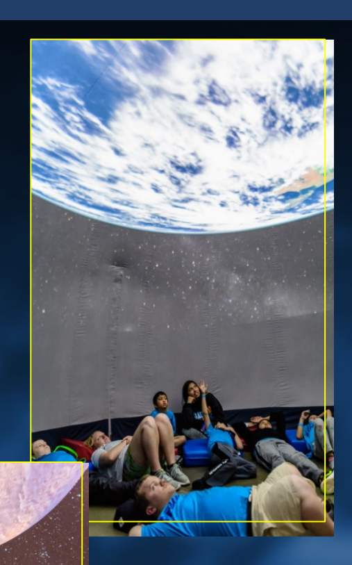
Participants at a family camp for children with cancer.