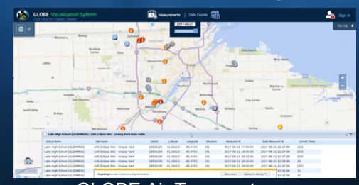
GLOBE Air Temperatures Toledo, OH Area during the Solar Eclipse

To see our webinars, go to GME YouTube: http://tinvurl.com/globemissioneart