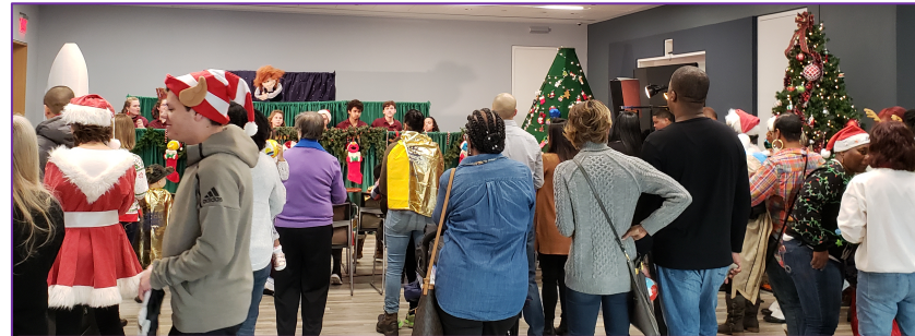
Participants watching the puppet show during the event.