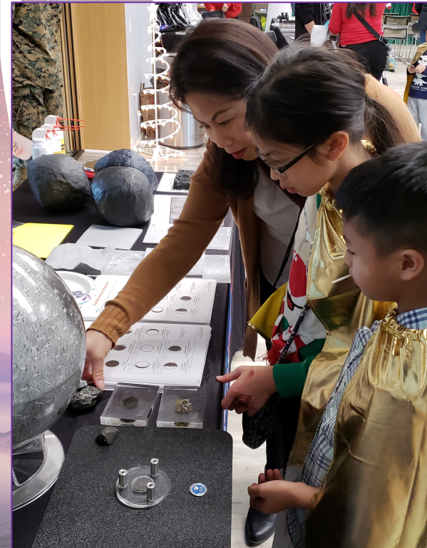
Excited kids learning about meteorites and Moon phases.