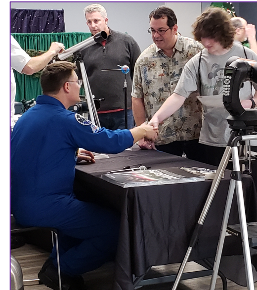
Astronaut Doug Wheelock chatting with attendees.