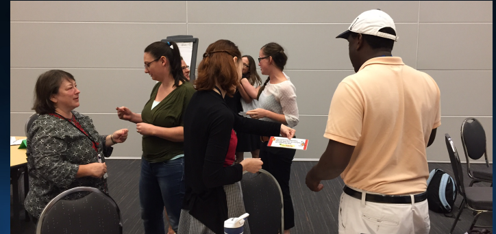
Participants discuss specific research-based strategies with a partner.