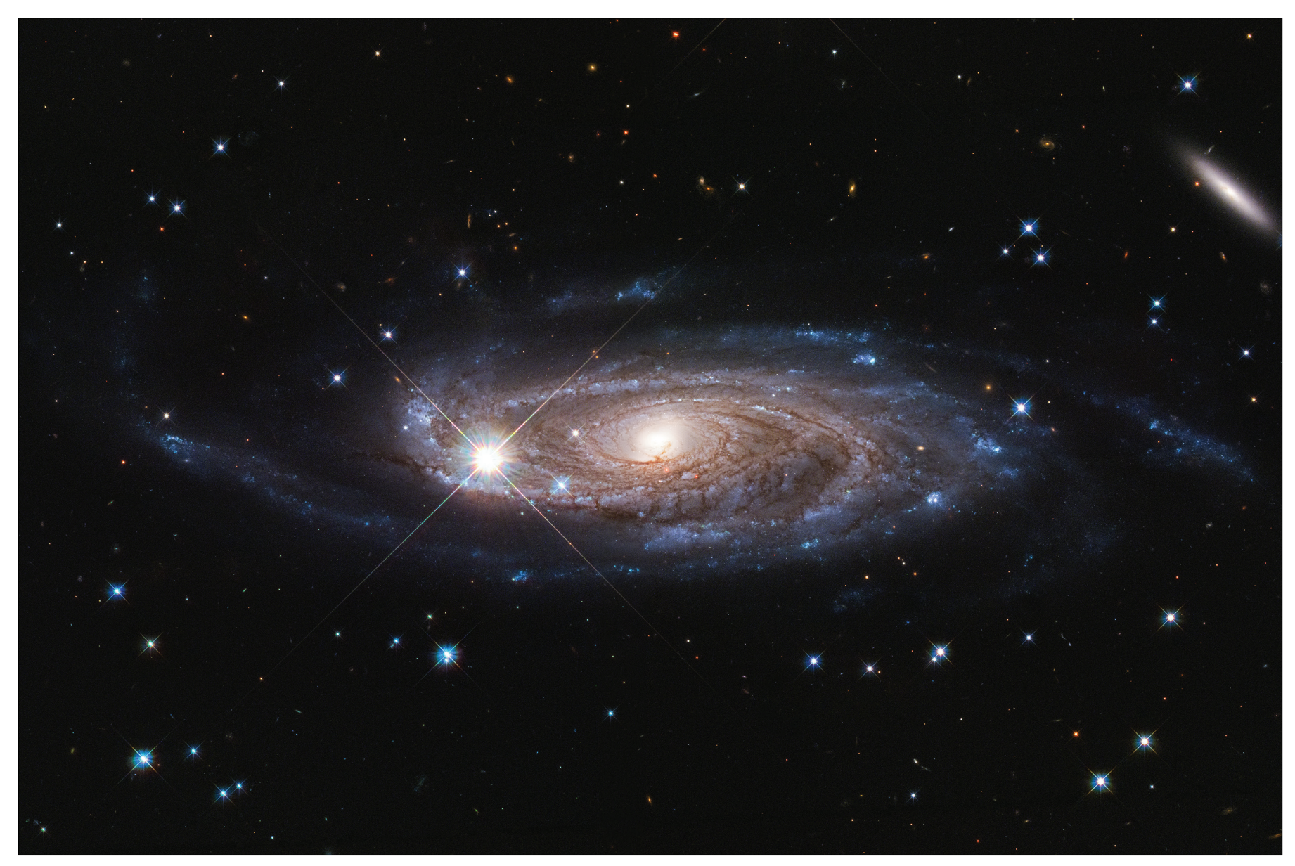
Galaxy UGC 2885 (Rubin's Galaxy)