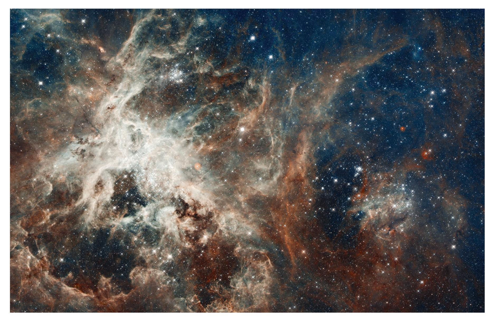
30 Doradus: A Turbulent Star-forming Region