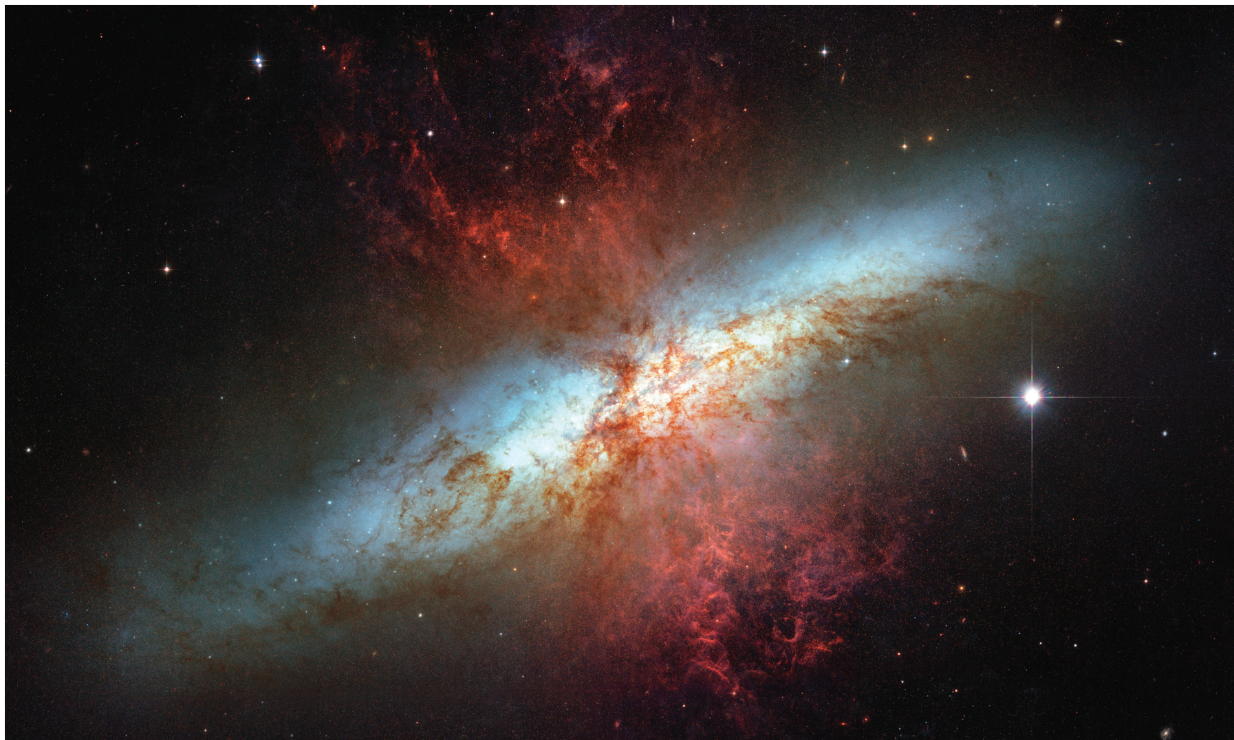
M82: A Starburst Galaxy