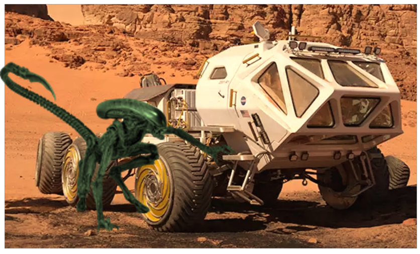
No one will change your flat tire on Mars!

Choose your rubber wisely, with RED 4 MARS! - booth 614