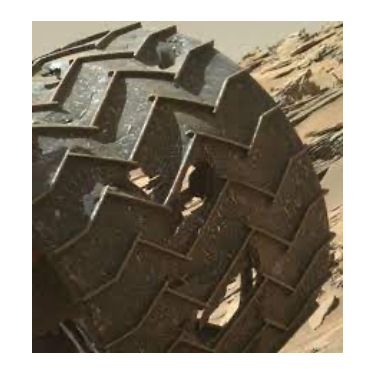
Curiosity's wheel damage